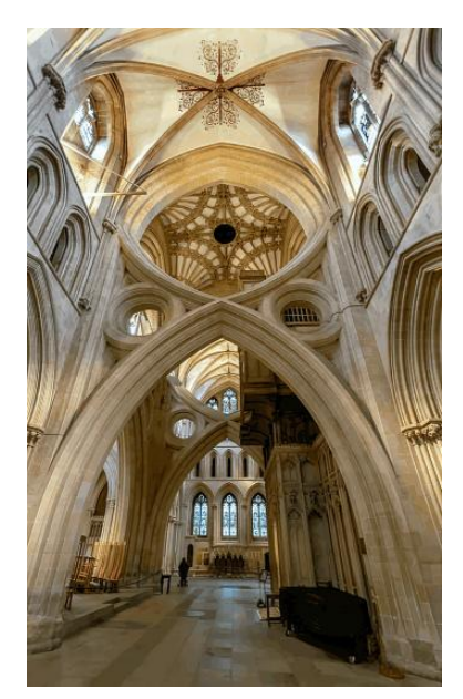
"The Arches of Wells" Kevin Harvey, England