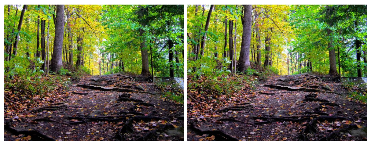
"Trail at Brandywine" Ursula Drinko, USA