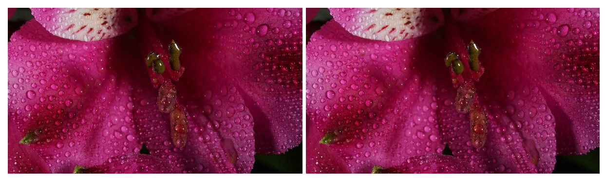
"Pink Flower and Waterdrops" George Themelis, USA