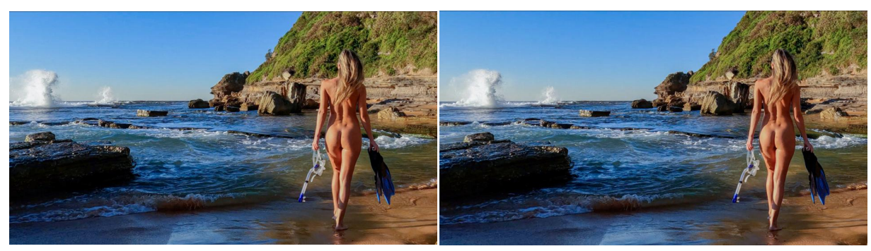
"Early Morning Swim" Stephen Wong, Australia