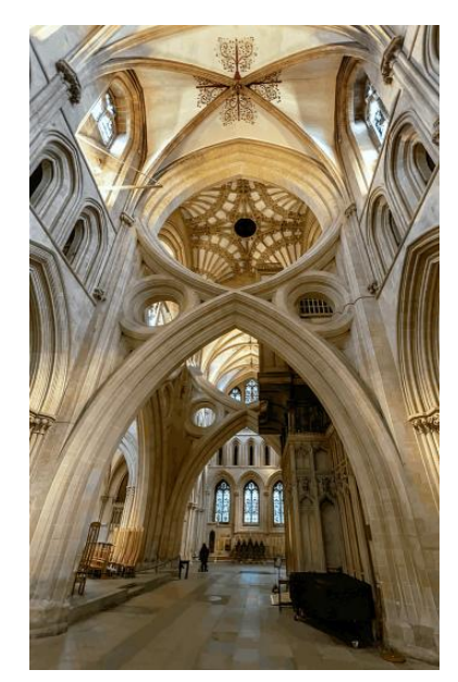
"The Arches of Wells" Kevin Harvey, England