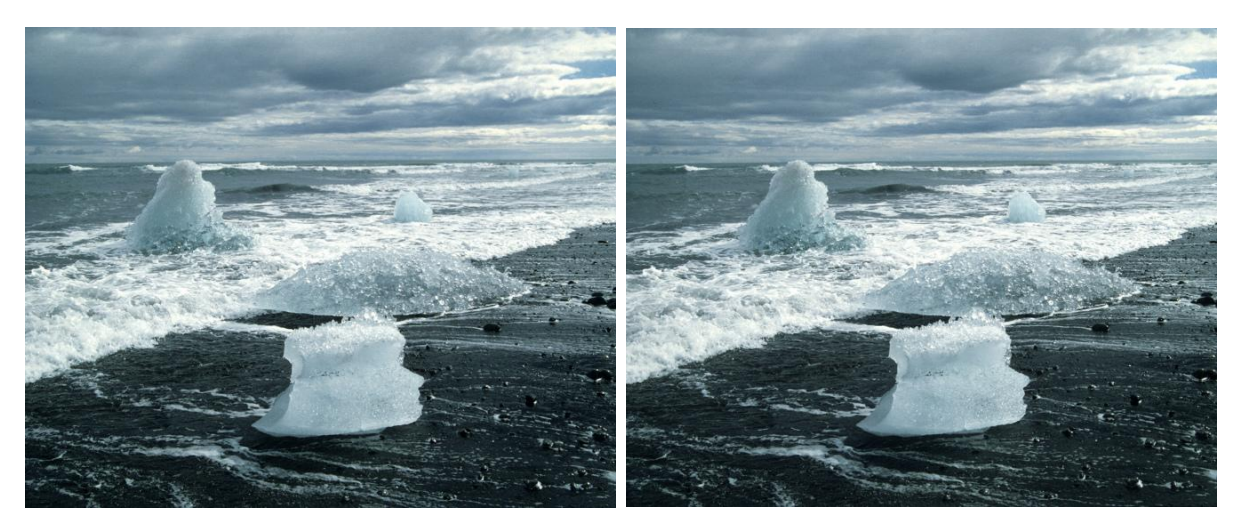
"Iceland 13" Bruno Braun, Germany