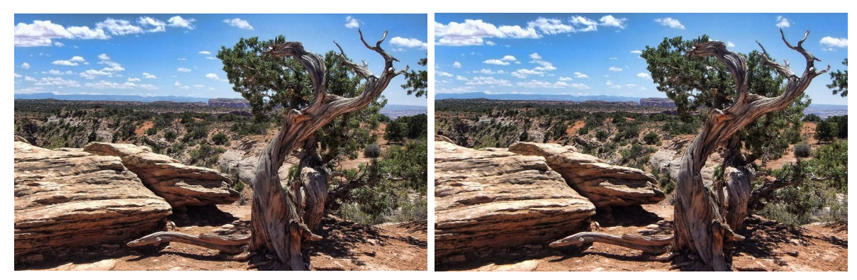
"Canyonlands" Charles Taylor, USA