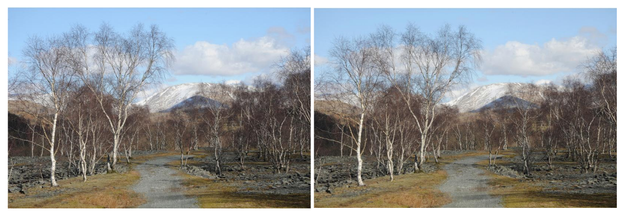
Southern Cross Judges' Choice "Abandoned slate quarry" Brian Davis, England